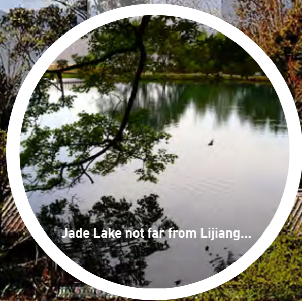
Jade Lake not far from Lijiang...

“LIJIANG is touristy, but there ARE HIDDEN GEMS to DISCOVER...”