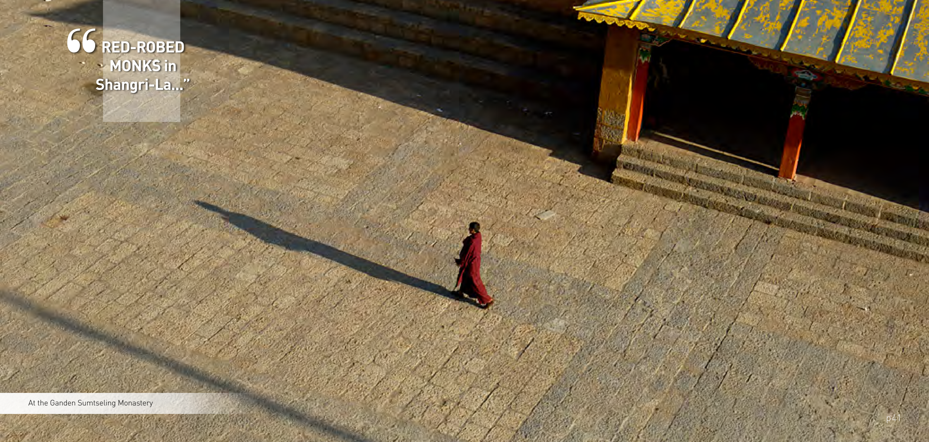
At the Ganden Sumtseling Monastery