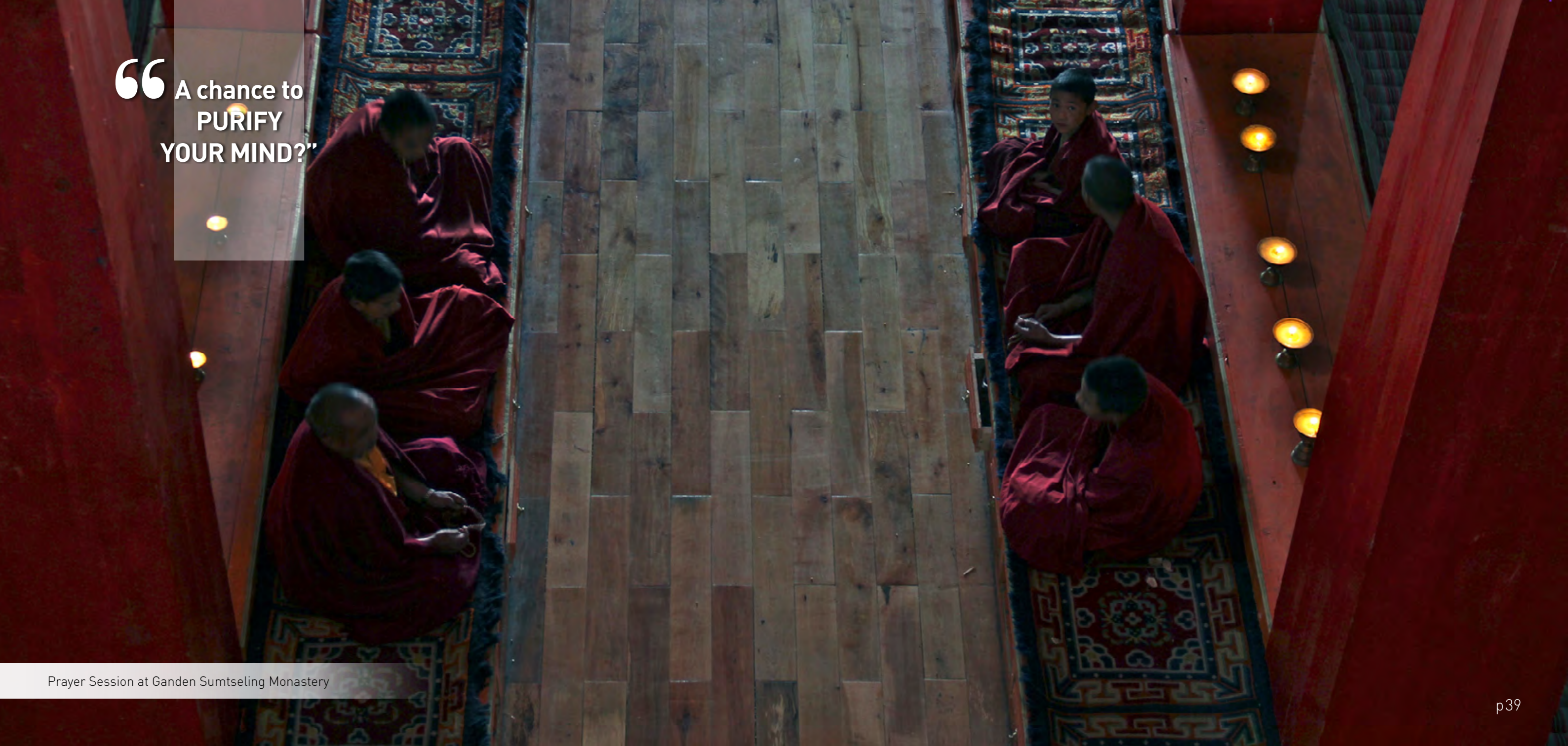
Prayer Session at Ganden Sumtseing Monastery