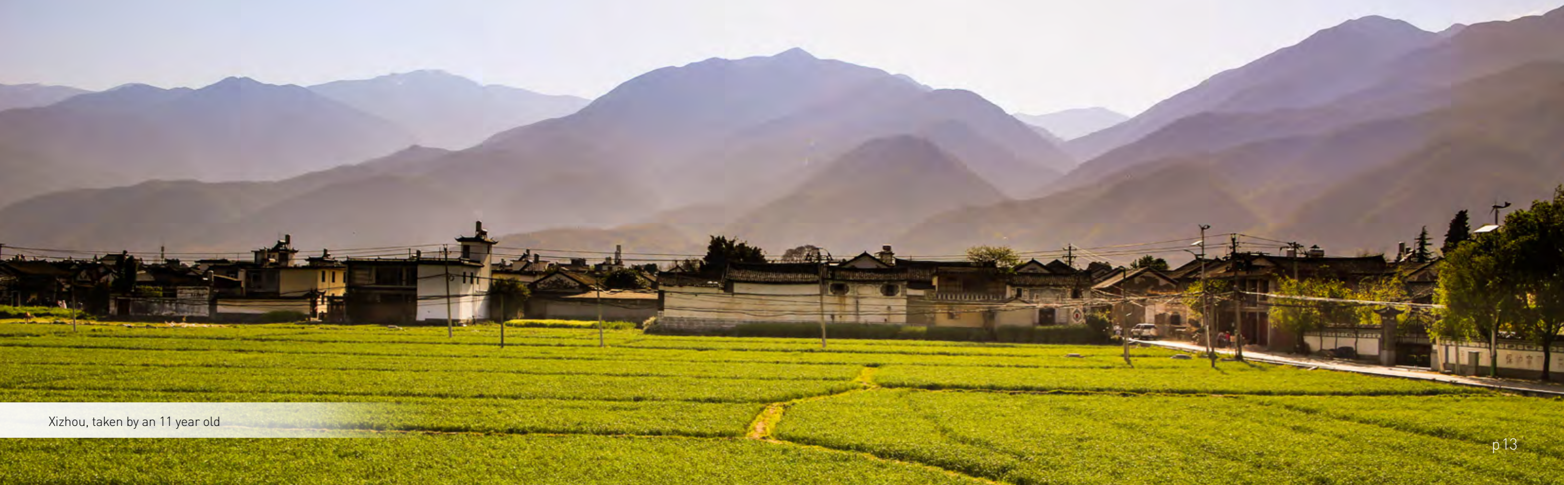
Xizhou, taken by an 11 year old

“Awaking in China’s RURAL COUNTRYSIDE...”