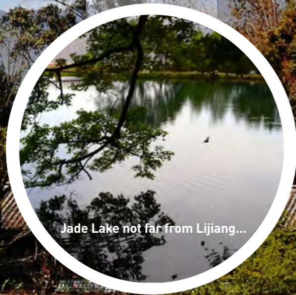
Jade Lake not far from Lijiang...

“LIJIANG is touristy, but there ARE HIDDEN GEMS to DISCOVER...”