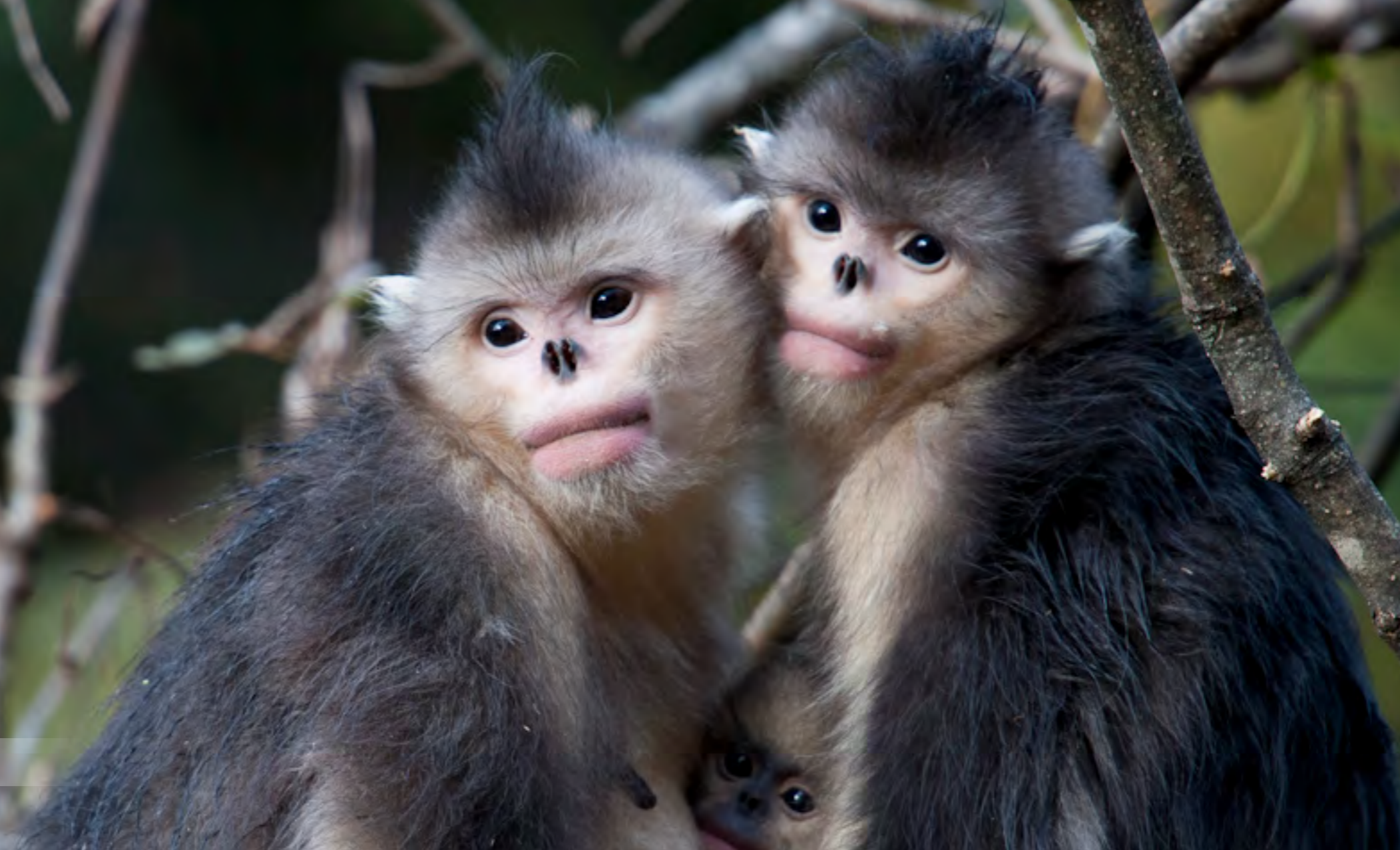
Yunnan Snub-Nosed monkeys

“Visiting the CUTEST MONKEYS in the world...”