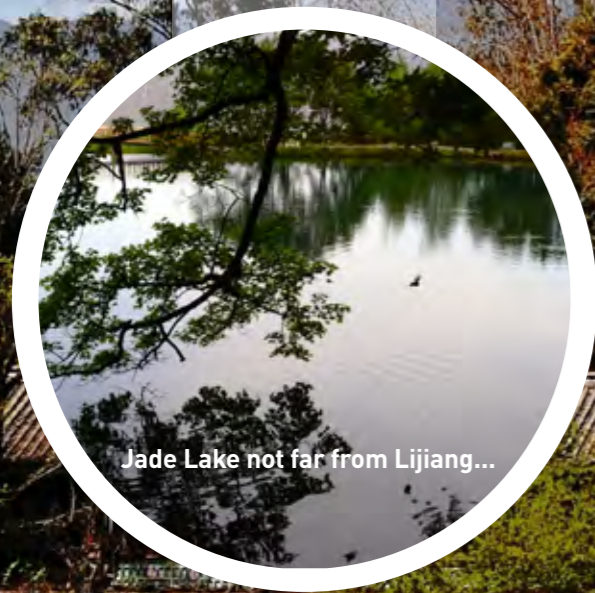
Jade Lake not far from Lijiang...

“LIJIANG is touristy, but there ARE HIDDEN GEMS to DISCOVER...”