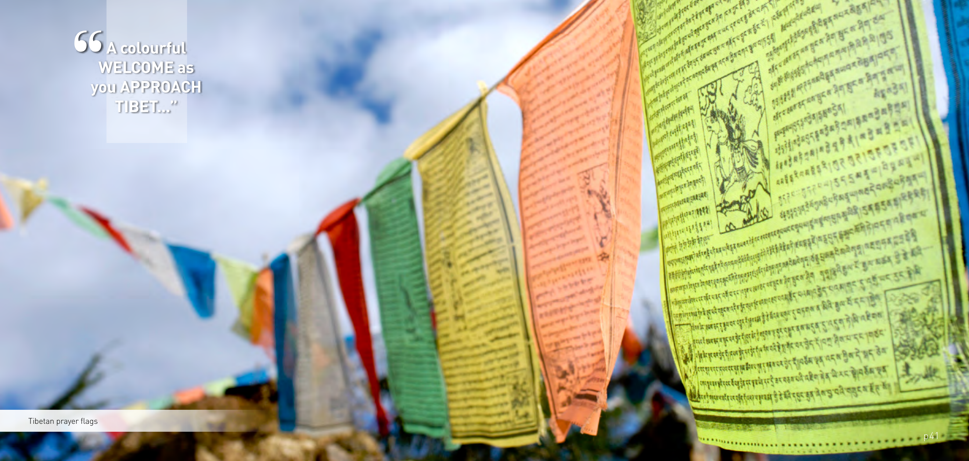
Tibetan prayer flags

“A colourful WELCOME as you APPROACH TIBET...”