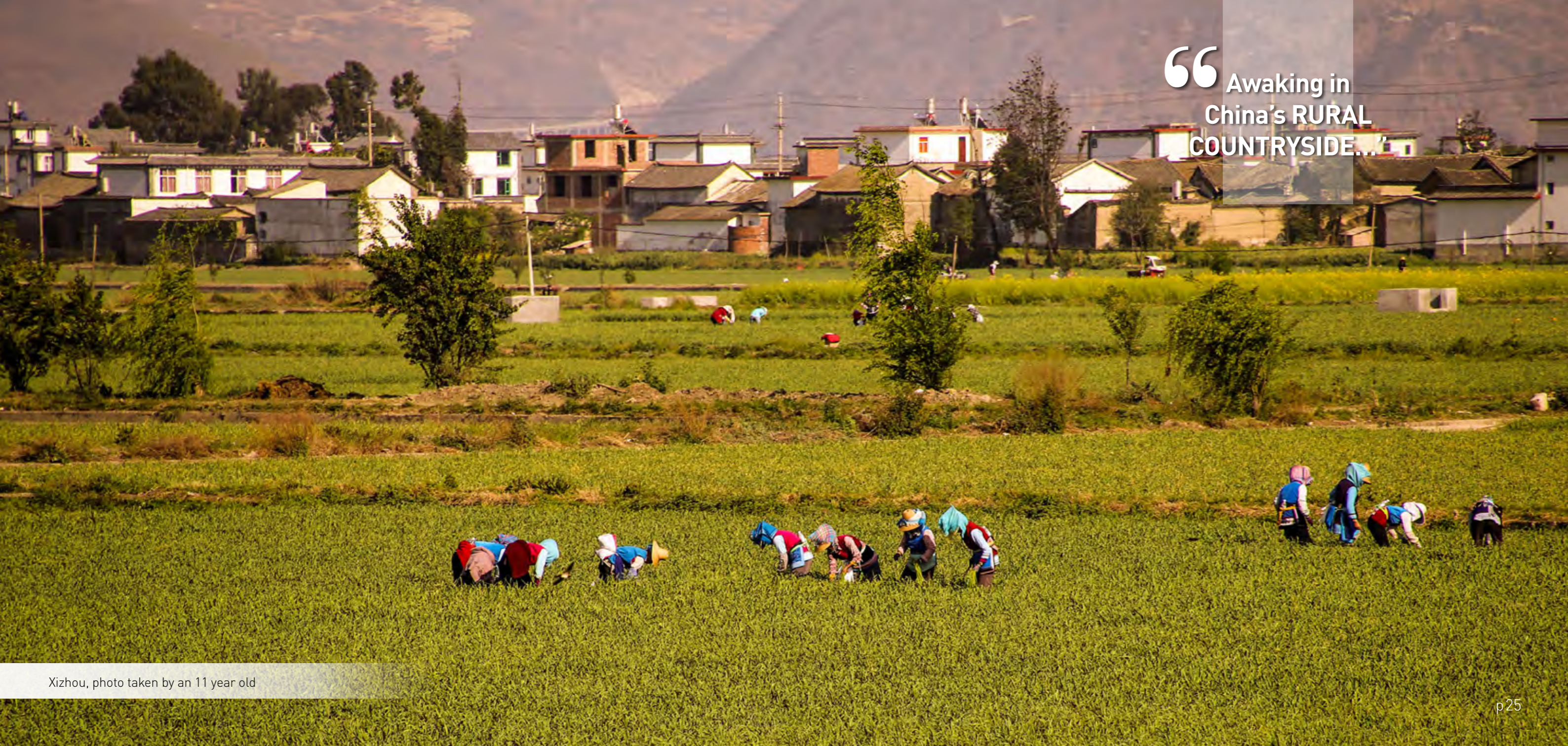
Xizhou, photo taken by an 11 year old